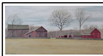
Nathan Hale Homestead Field

A sponsored project of Windham Arts/ADA compliant