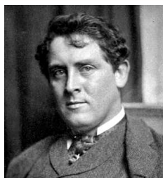
Julian Alden Weir (1852-1919) As the father of American Impressionism, Weir used new, international ideas about painting to change American art.